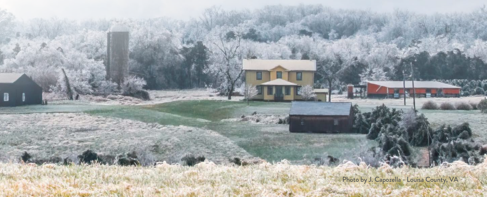
Louisa County, VA